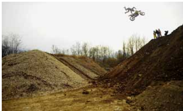
rider: Mike Metzger

Natural dirt line: gaps, spines, doubles, transferts